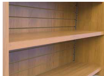
Wood shelves for slatwall back panel