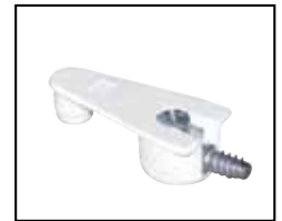
Cam lock anchoring