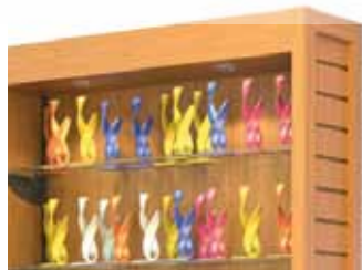
Slatwall on side panel for additional hanging