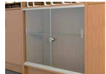
Glass section with lock