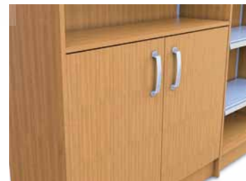
Reserve cabinet with doors