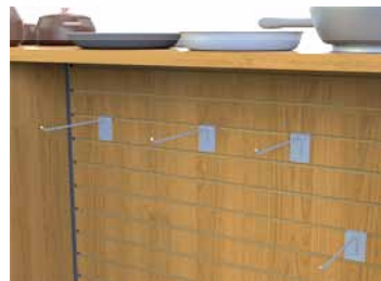
Hooks for slatwall back panel