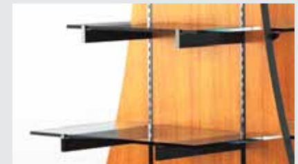
Glass shelves with steel brackets