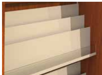
Stepped metal shelves (3 or 4) with acrylic fence in the front