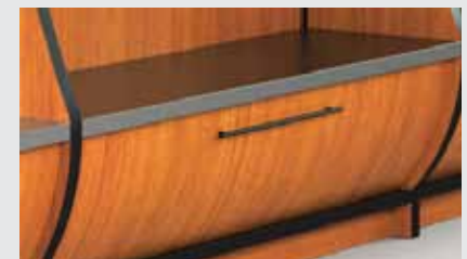
Concave drawer with MDF laminated top